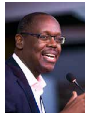
Executive Director, Twaweza East Africa