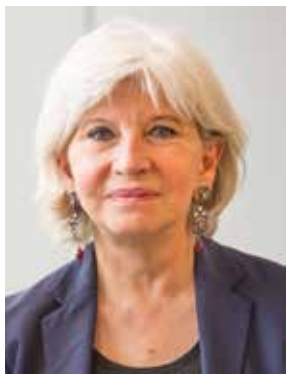
CEO, European Climate Foundation

Laurence Tubiana chairs the French Development Agency and teaches at Sciences Po, Paris. Before joining the ECF, she was France's Climate Change Ambassador and Special Representative for COP21, and an architect of the landmark Paris Agreement. Following COP21, she was appointed High Level Champion for climate action. She served as senior adviser on the Environment to a former French prime minister and chaired the French National Debate on the Energy Transition. She brings decades of expertise in climate change, energy, agriculture and sustainable development, working across government, think tanks, NGOs and academia. She founded Solagral, an NGO working on food security and the global environment; the Institute of Sustainable Development and International Relations (IDDRI); and the Directorate for Global Public Goods at the French Ministry of Foreign Affairs. She has been a member of numerous boards and scientific committees, including the Chinese Committee on the Environment and International Development.